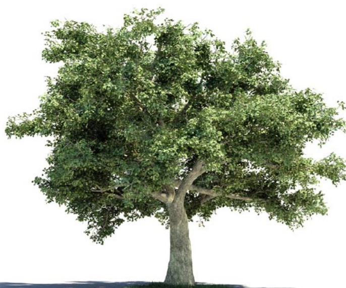
001 _ Quercus

Archmodels volume 2 prepared only for Cinema 4D gives you 60 professional, highly detailed objects for architectural visualizations. This collection gives you huge library of very realistic plants. Why waste costly time for making something that you can have from the best at Evermotion?