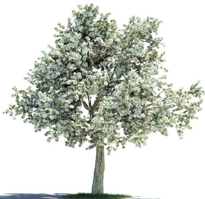
044 _ Pyrus