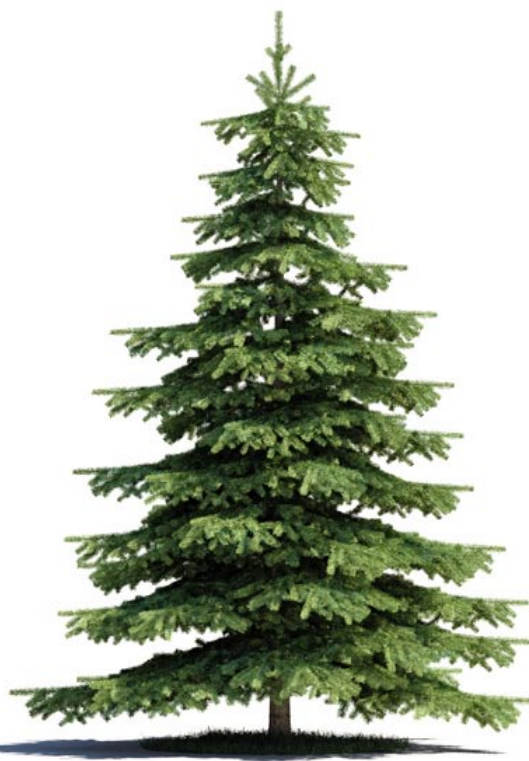
020 _ Picea