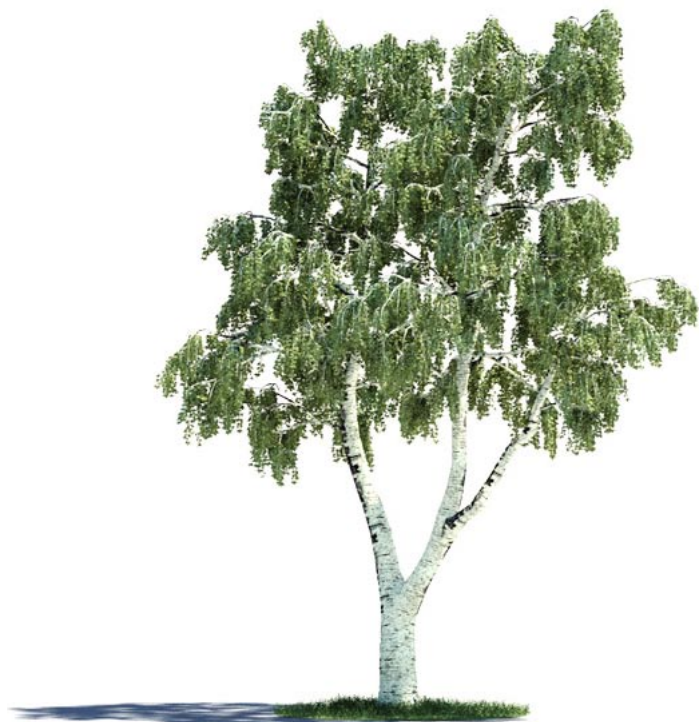
039 _ Betula_01