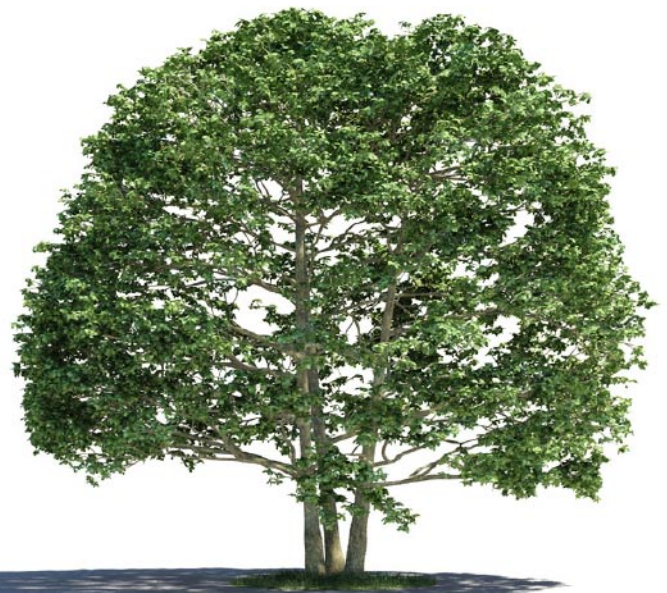
008 _ Alnus