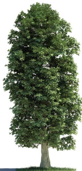
010 _ Tilia platyphyllos