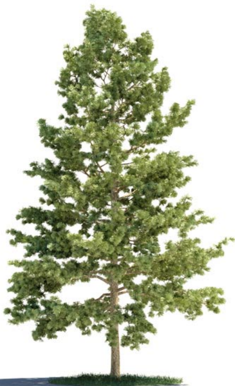
031 _ Pinus_strobus