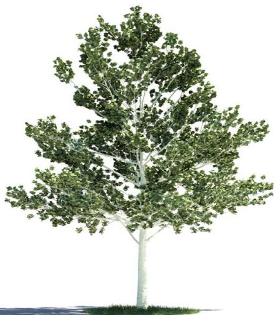
003 _ Betula