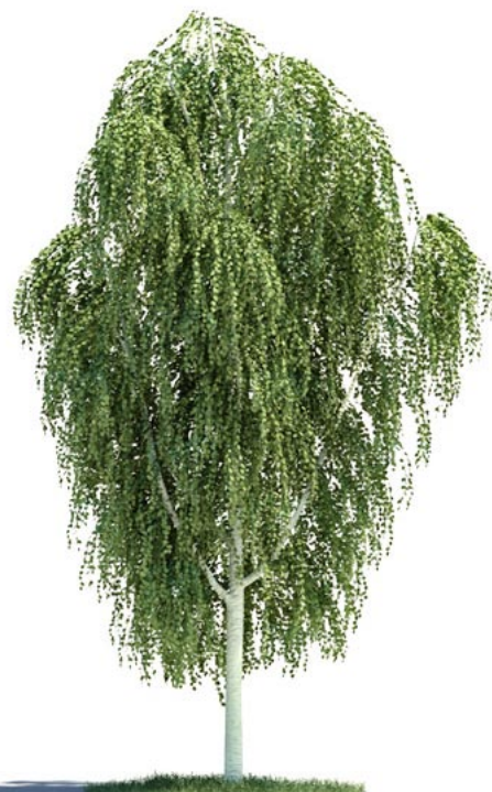
018 _ Betula