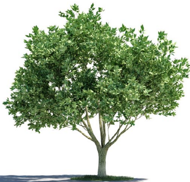
042 _ Olea europaea