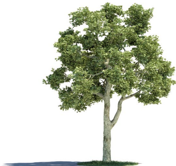
037 _ Fraxiuns_02