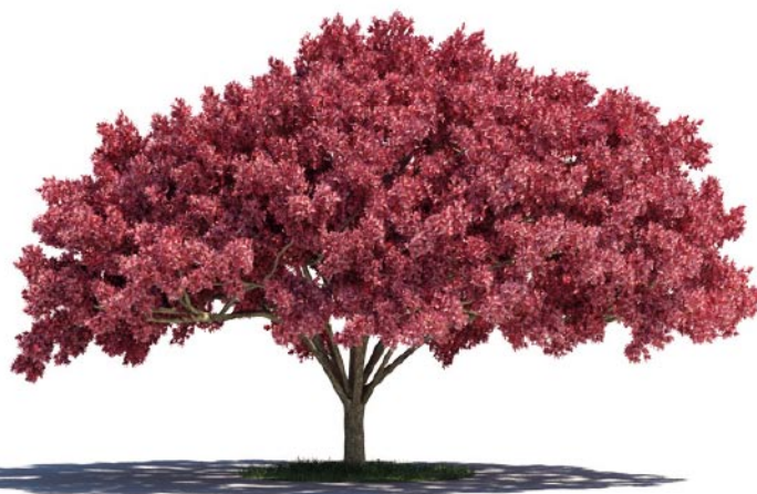
012 _ Cherry tree