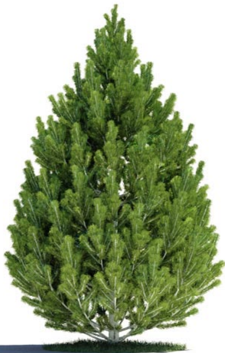
021 _ Pinus leucodermis