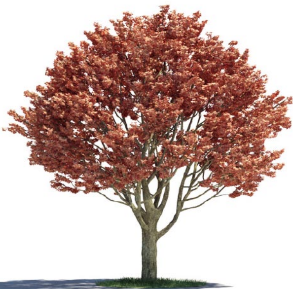
007 _ Acer griseum