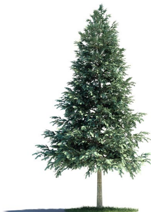
050 _ Picea_abies