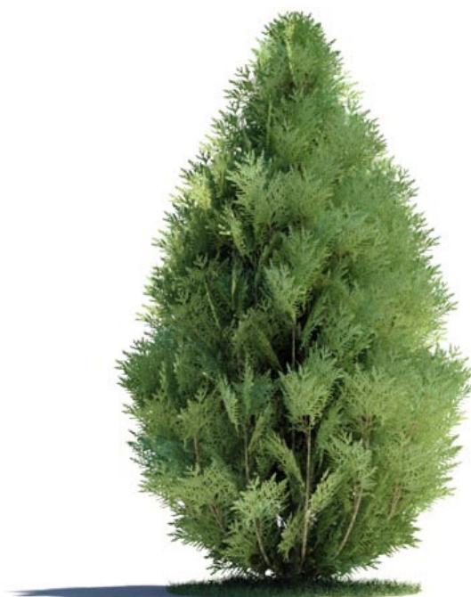
022 _ Chamaecyparis lawsoniana