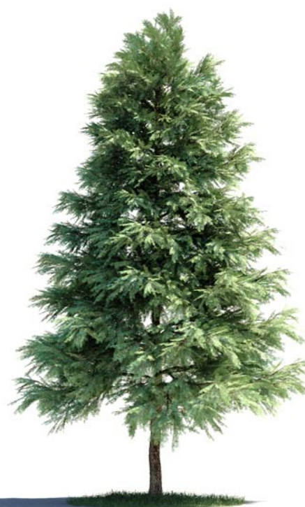
048 _ Pinus_sylvestris_02