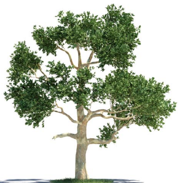
060 _ Eucalyptus