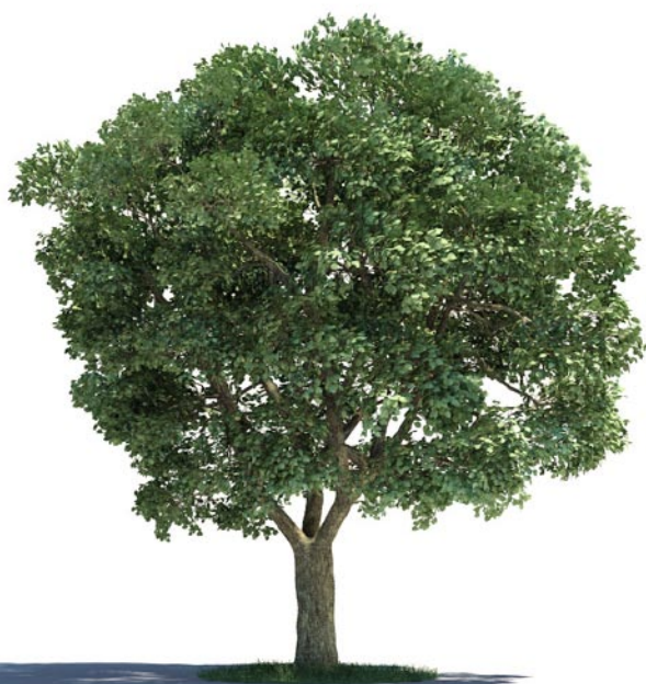
011 _ Ulmus