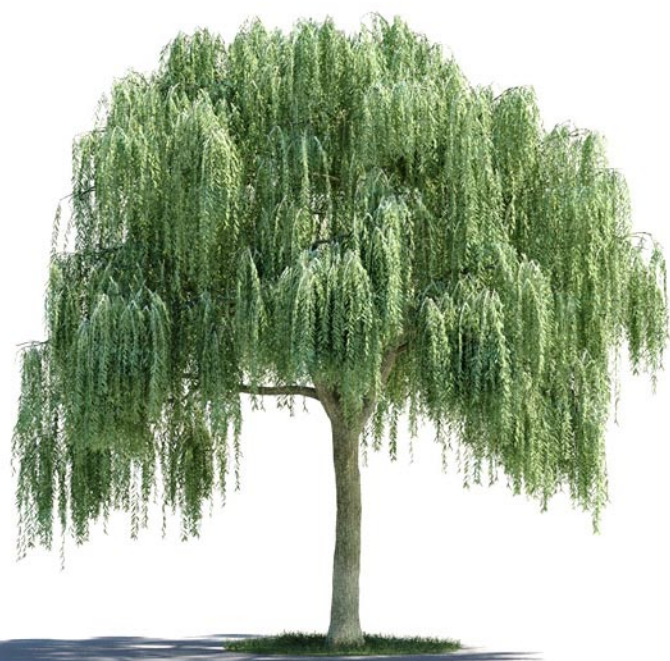
045 _ Salix_01