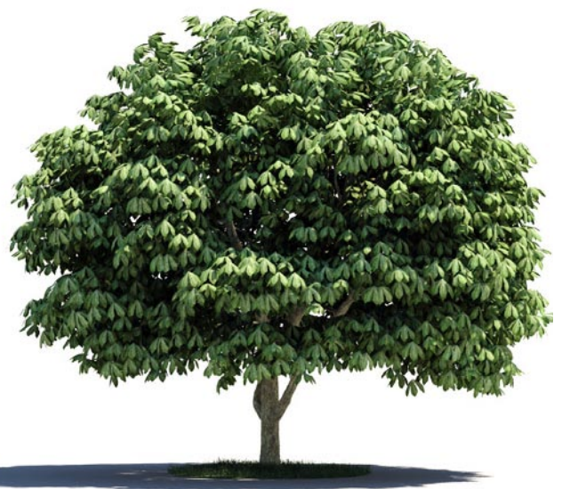
016 _ Aesculus