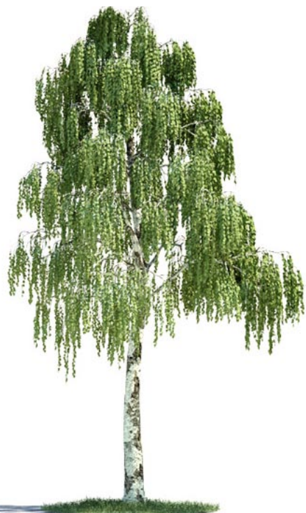
049 _ Betula_02