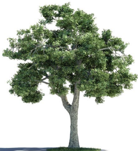
029 _ Fraxinus