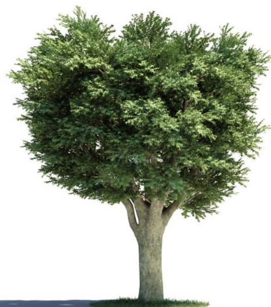
002 _ Ulmus campestris