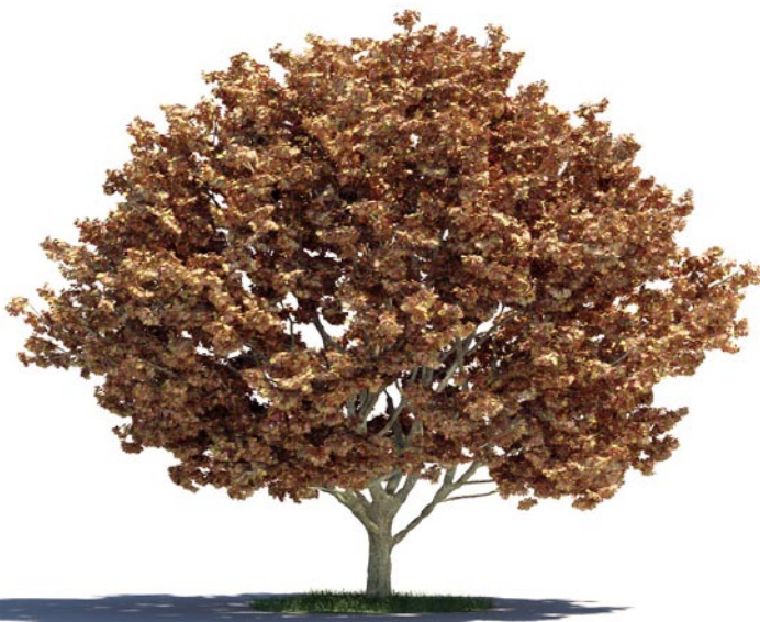
015 _ Acer