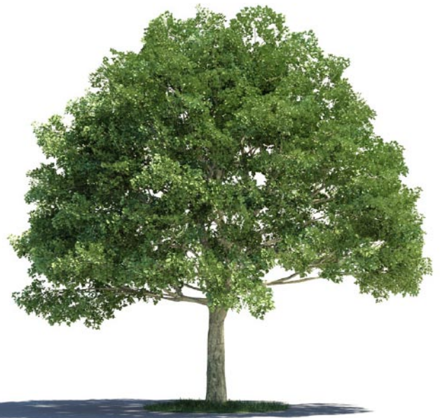
014 _ Quercus