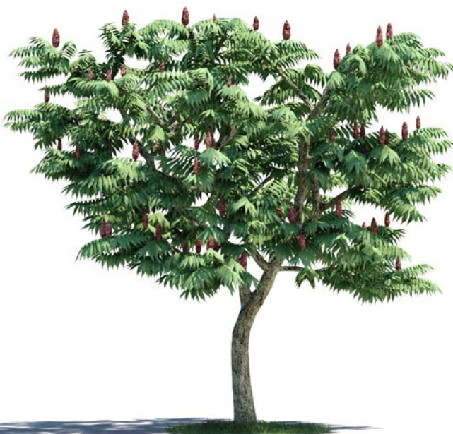
059 _ Rhus_typhina