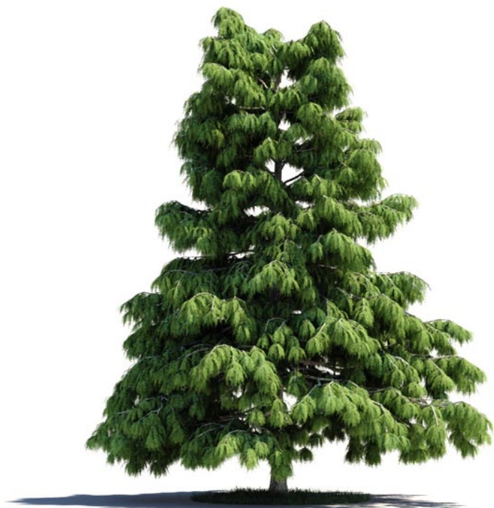
033 _ Cedrus_deodara