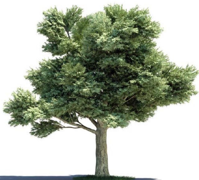
025 _ Quercus petraea