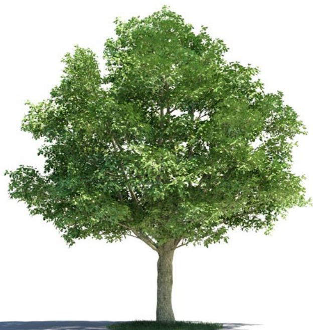
009 _ Quercus robur