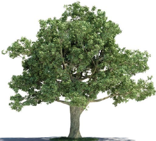
005 _ Quercus