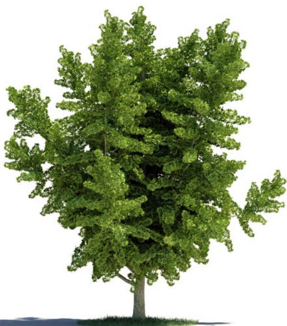
027 _ Ginkgo biloba