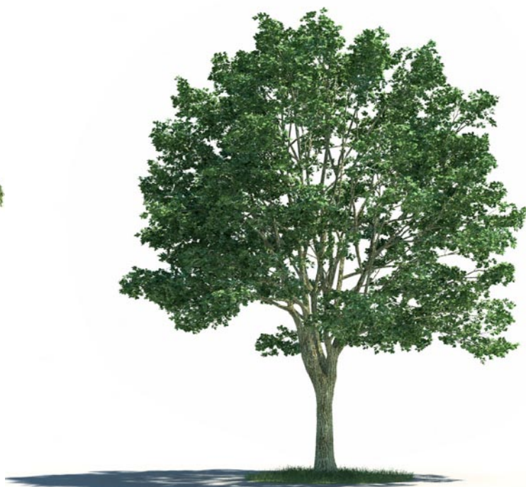
040 _ Tilia