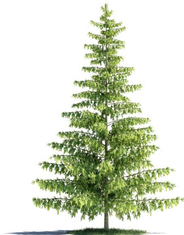
052 _ Pinus