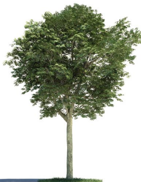
004 _ Fraxinus