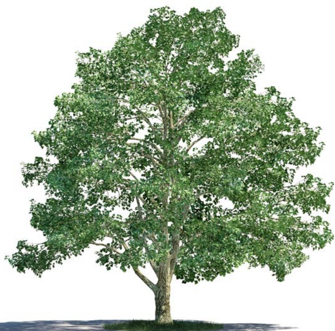
043 _ Tilia_02