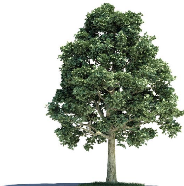
036 _ Acer