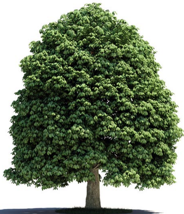
017 _ Aesculus