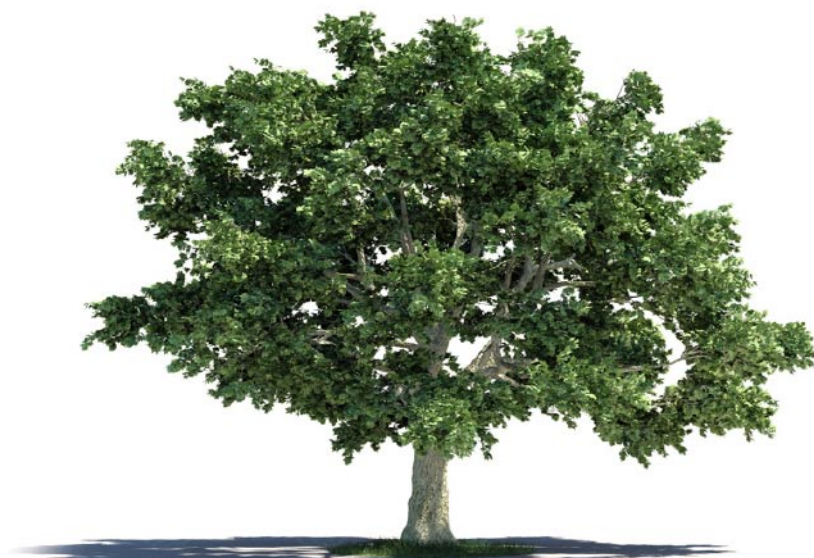
030 _ Acer_saccharum