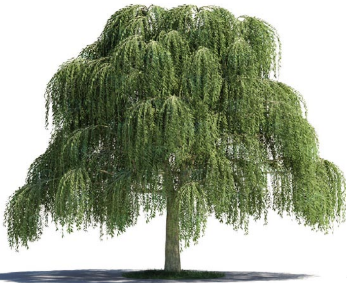
013 _ Salix