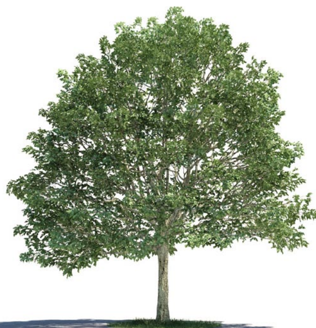
046 _ Carpinus_2