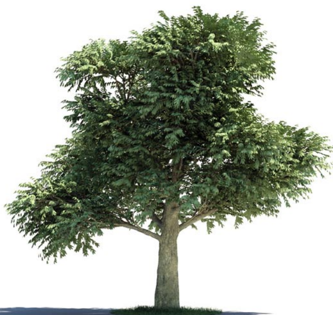
024 _ Arbutus menziesii