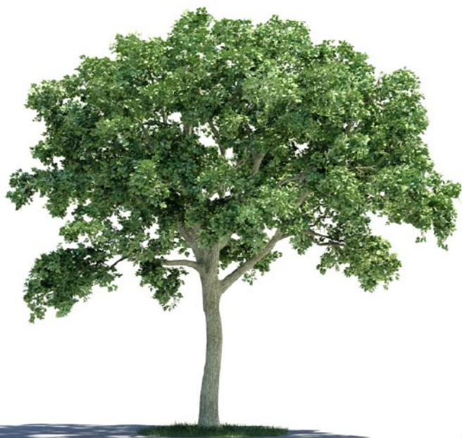
041 _ Ulmus