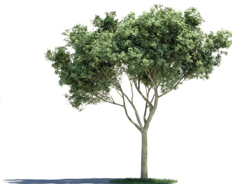
028 _ Salix fragilis