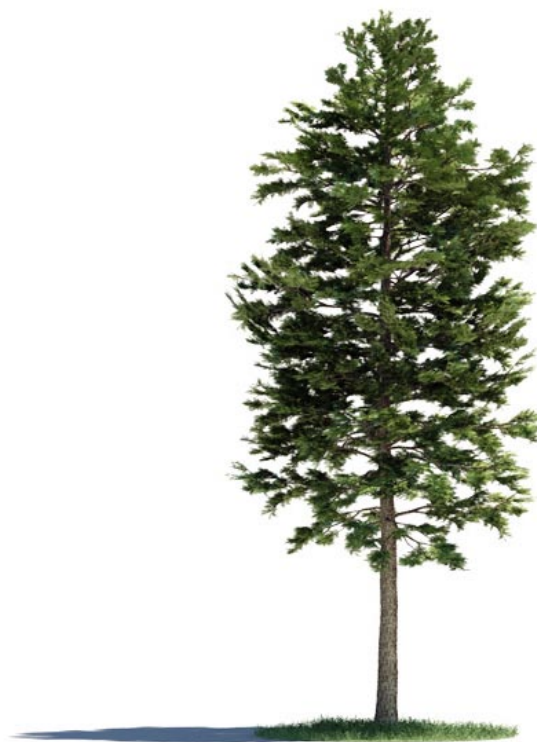
032 _ Pinus_sylvestris