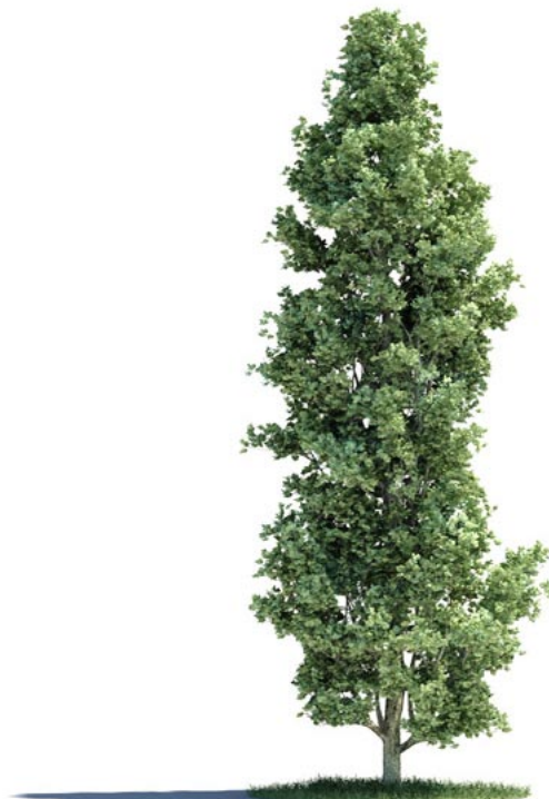
038 _ Populus