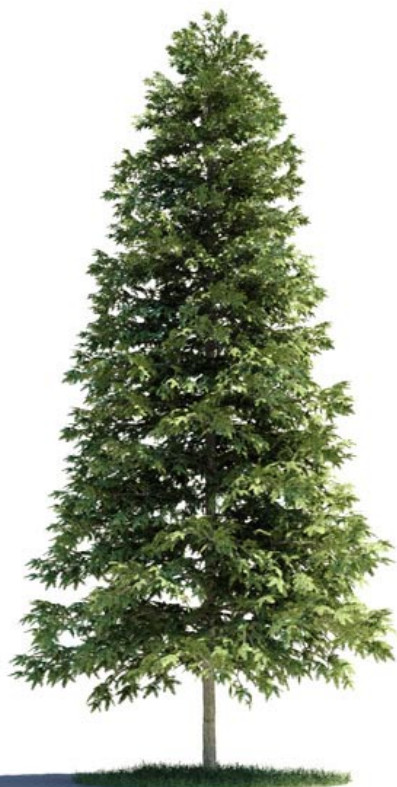
051 _ Picea_abies_2