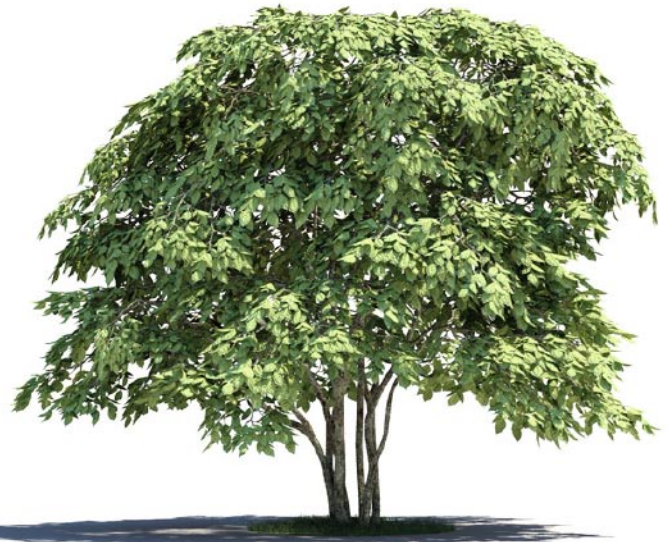
058 _ Staphyella_pinnata