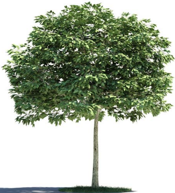
057 _ Sorbus