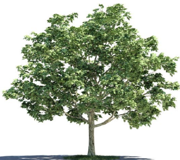
035 _ Acer_platanoides