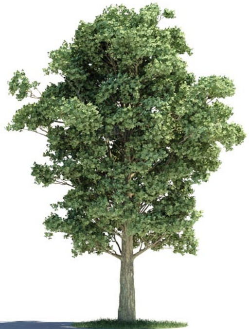
006 _ Populus x canescens