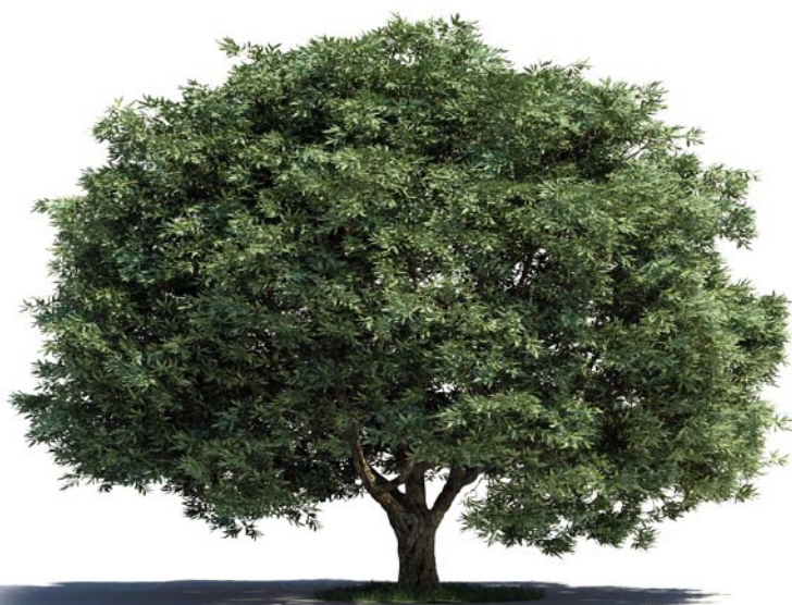
047 _ Salix_fragilis