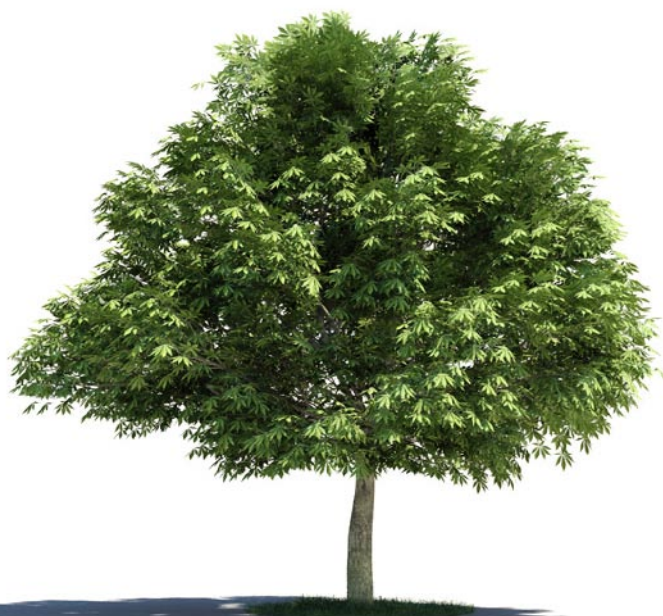
023 _ Aesculus glabra