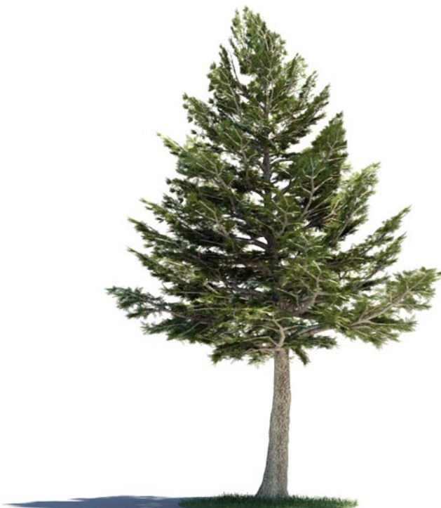
034 _ Cedrus_libani