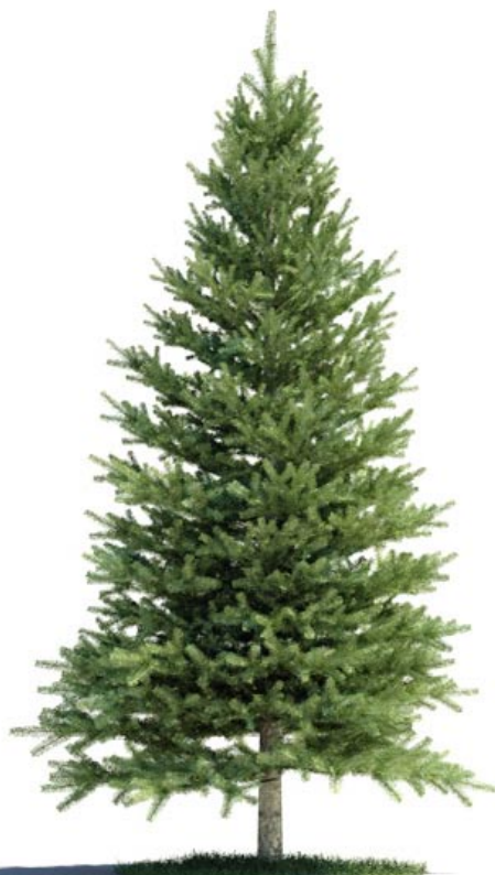
019 _ Pinus