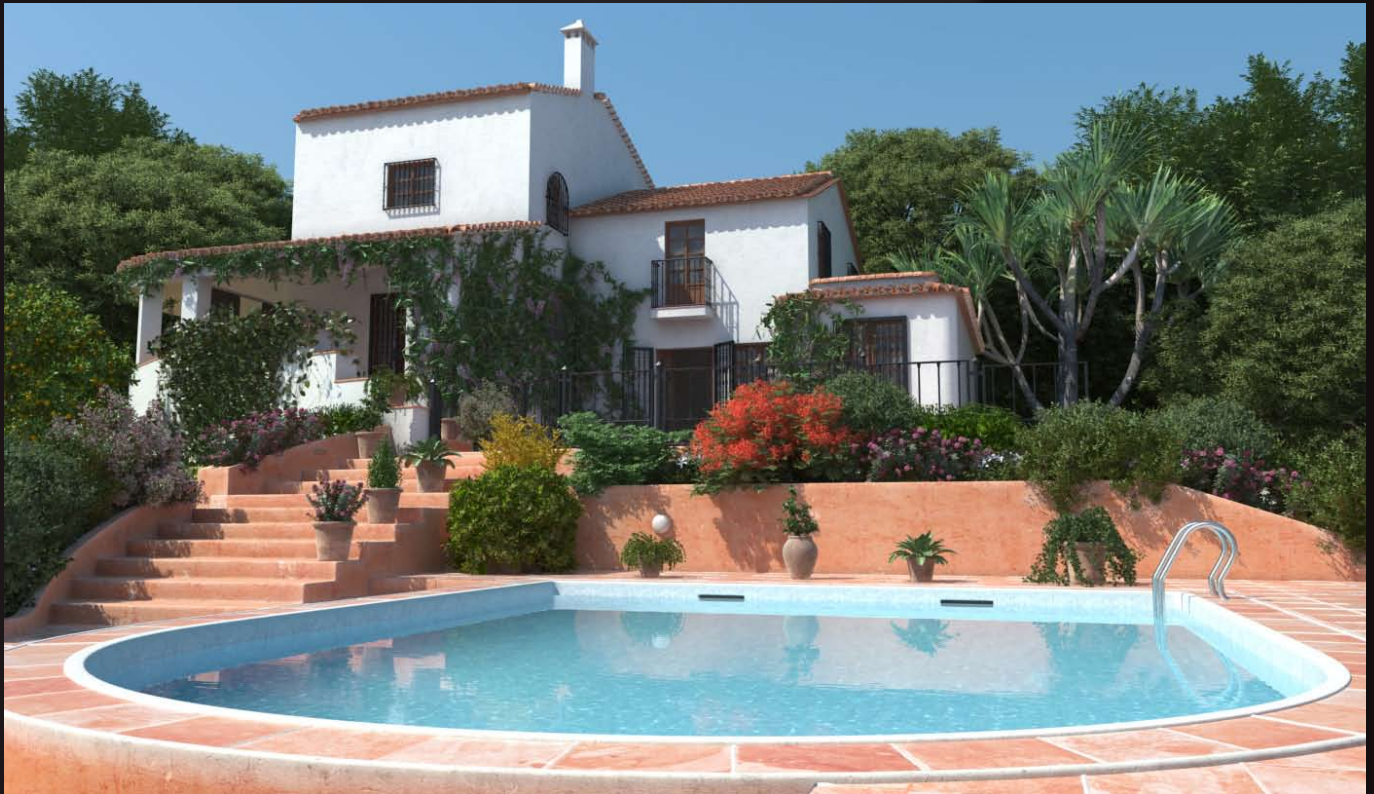
scene 09 raw

Have you ever wanted to make professional exterior renderings? Do you know how to use V-RaySun, V-RaySky and V-RayPhysicalCamera? Have you ever had problems with composition? Archexteriors will end all your problems. Take a look at this 10 fully textured scenes with professional shaders and lighting ready to render. Get your own portfolio and join cg market.