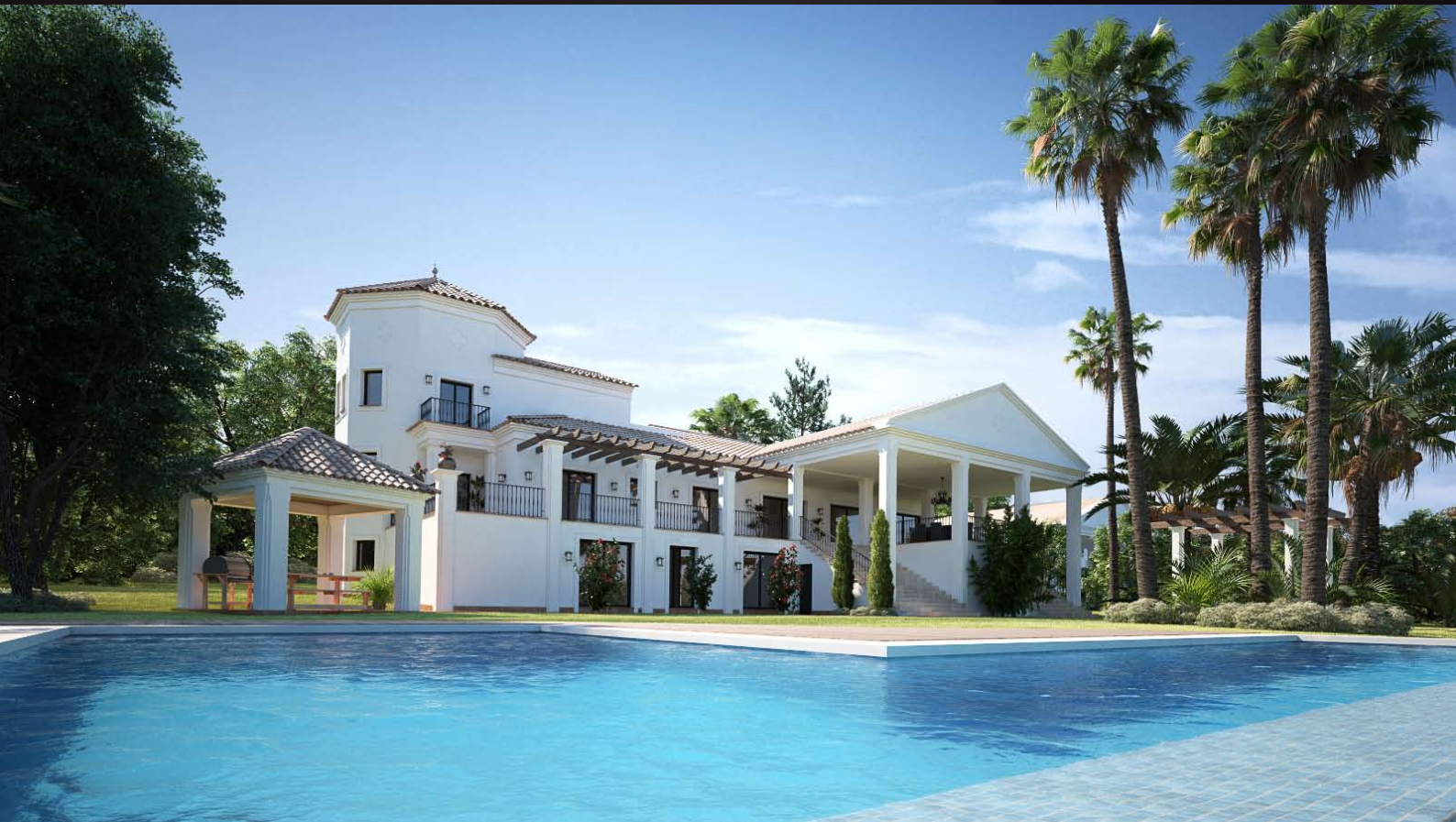
scene 10 post production

Have you ever wanted to make professional exterior renderings? Do you know how to use V-RaySun, V-RaySky and V-RayPhysicalCamera? Have you ever had problems with composition? Archexteriors will end all your problems. Take a look at this 10 fully textured scenes with professional shaders and lighting ready to render. Get your own portfolio and join cg market.