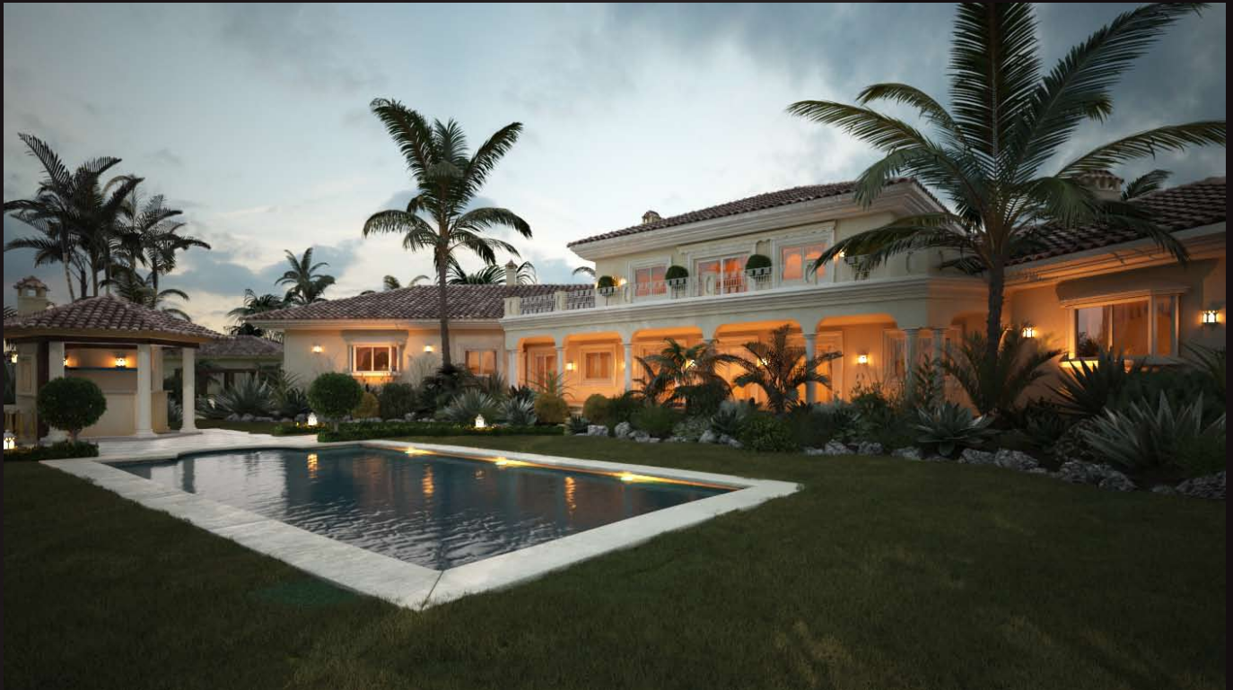
scene 03 raw

Have you ever wanted to make professional exterior renderings? Do you know how to use V-RaySun, V-RaySky and V-RayPhysicalCamera? Have you ever had problems with composition? Archexteriors will end all your problems. Take a look at this 10 fully textured scenes with professional shaders and lighting ready to render. Get your own portfolio and join cg market.