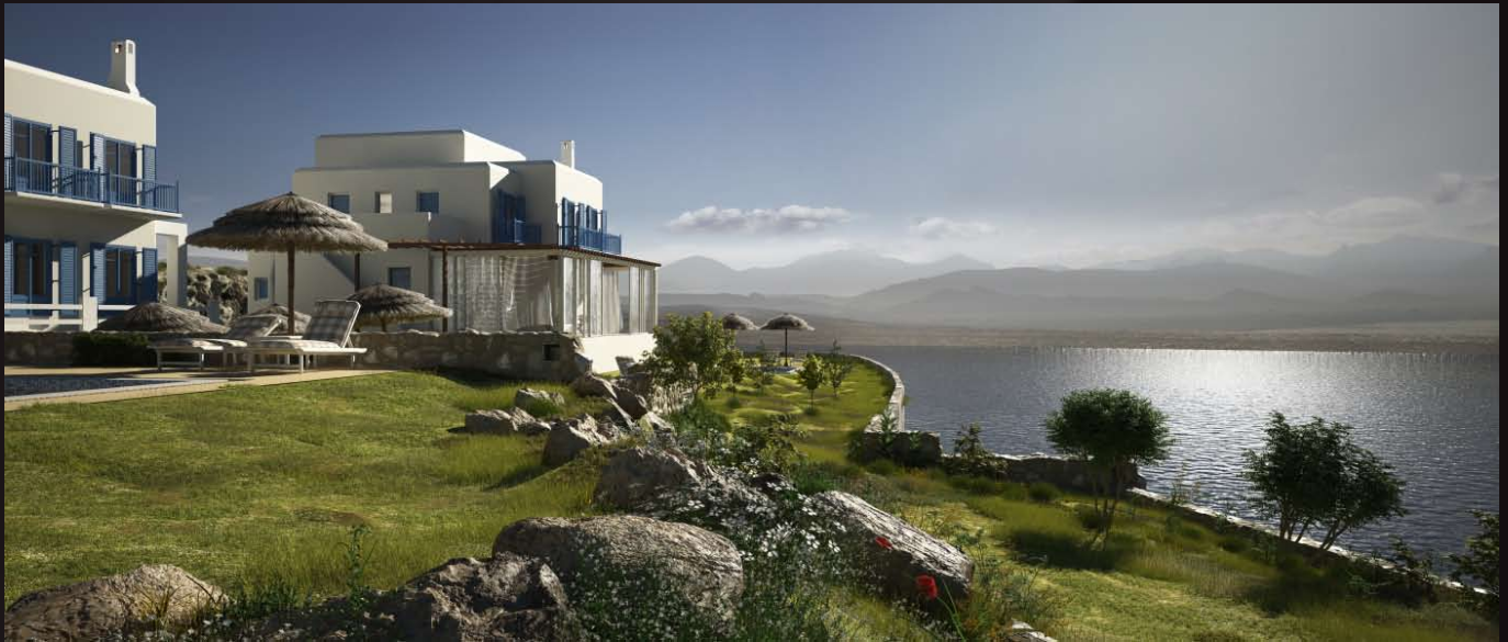
scene 01 raw

Have you ever wanted to make professional exterior renderings? Do you know how to use V-RaySun, V-RaySky and V-RayPhysicalCamera? Have you ever had problems with composition? Archexteriors will end all your problems. Take a look at this 10 fully textured scenes with professional shaders and lighting ready to render. Get your own portfolio and join cg market.