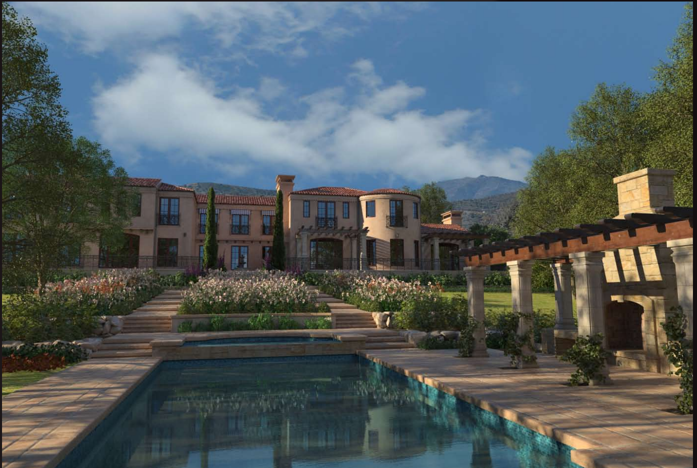
scene 04 raw

Have you ever wanted to make professional exterior renderings? Do you know how to use V-RaySun, V-RaySky and V-RayPhysicalCamera? Have you ever had problems with composition? Archexteriors will end all your problems. Take a look at this 10 fully textured scenes with professional shaders and lighting ready to render. Get your own portfolio and join cg market.