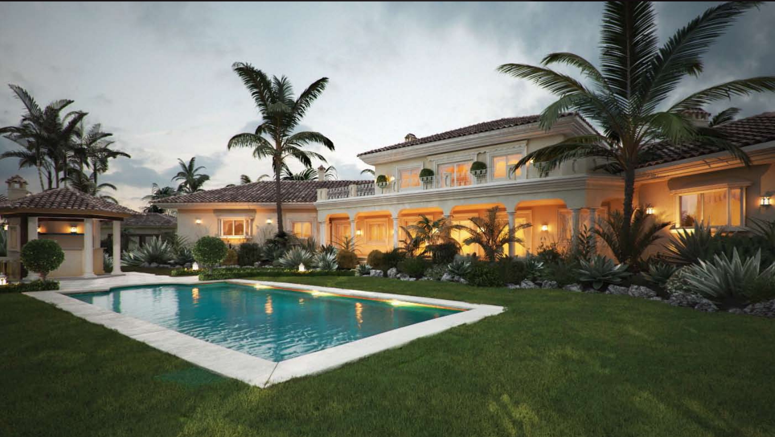
scene 03 post production

Have you ever wanted to make professional exterior renderings? Do you know how to use V-RaySun, V-RaySky and V-RayPhysicalCamera? Have you ever had problems with composition? Archexteriors will end all your problems. Take a look at this 10 fully textured scenes with professional shaders and lighting ready to render. Get your own portfolio and join cg market.