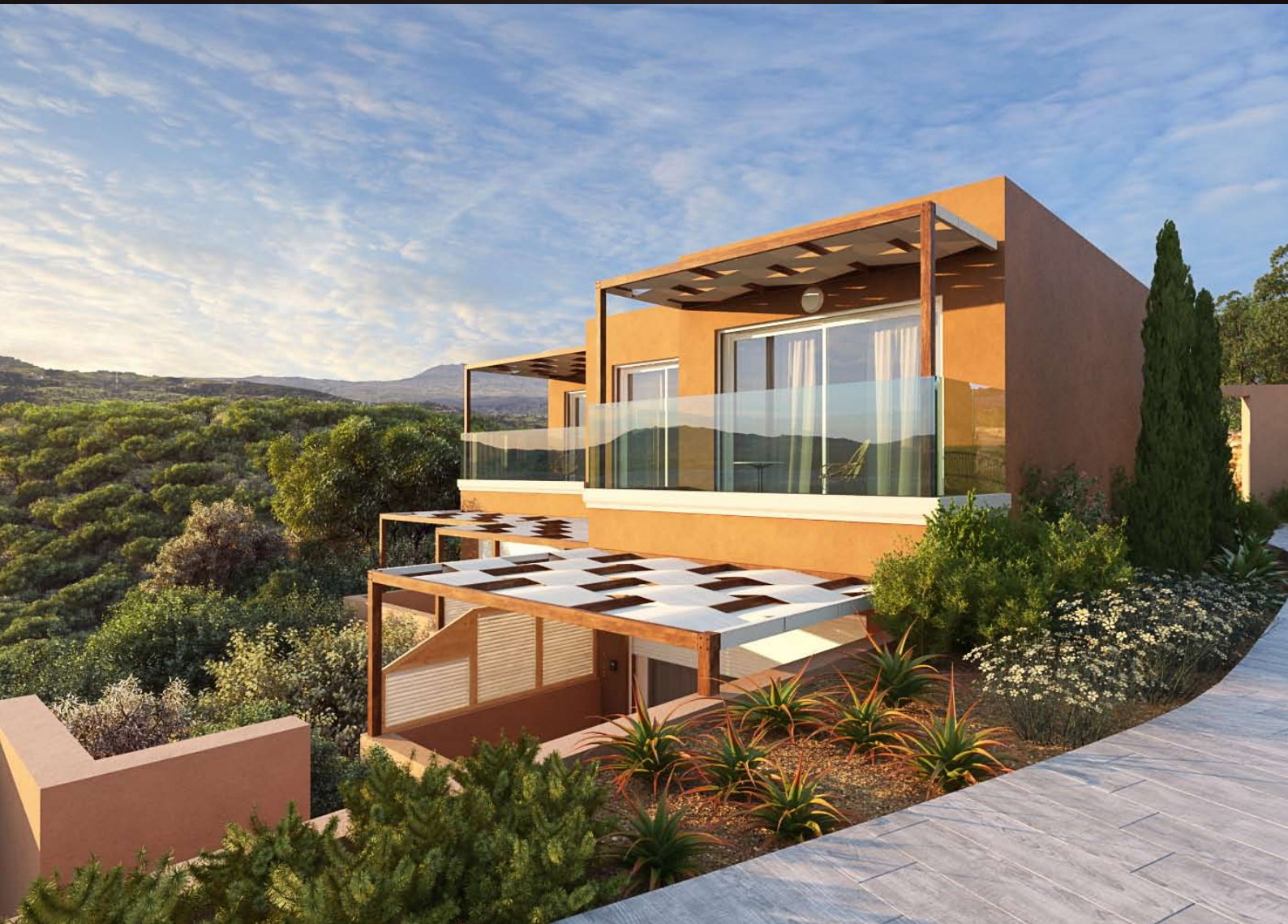
scene 05 post production

Have you ever wanted to make professional exterior renderings? Do you know how to use V-RaySun, V-RaySky and V-RayPhysicalCamera? Have you ever had problems with composition? Archexteriors will end all your problems. Take a look at this 10 fully textured scenes with professional shaders and lighting ready to render. Get your own portfolio and join cg market.