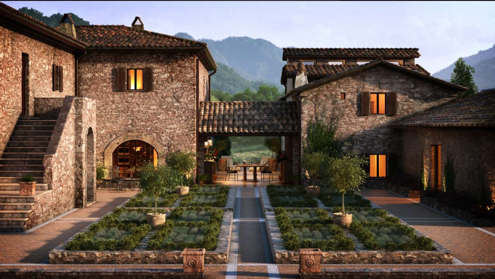
scene 06 post production

Have you ever wanted to make professional exterior renderings? Do you know how to use V-RaySun, V-RaySky and V-RayPhysicalCamera? Have you ever had problems with composition? Archexteriors will end all your problems. Take a look at this 10 fully textured scenes with professional shaders and lighting ready to render. Get your own portfolio and join cg market.