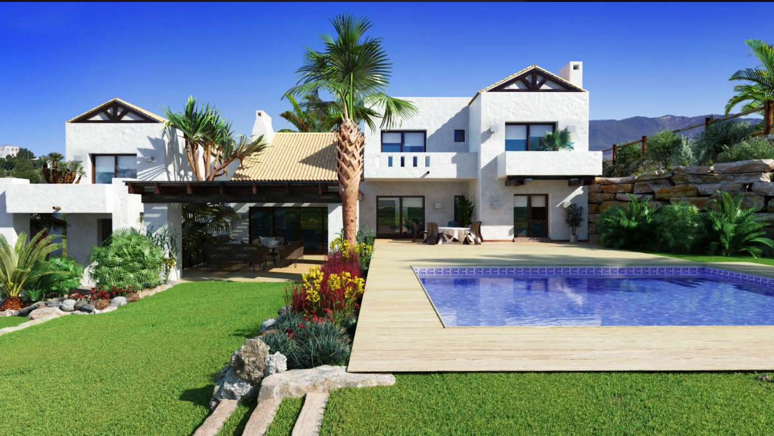
scene 08 post production

Have you ever wanted to make professional exterior renderings? Do you know how to use V-RaySun, V-RaySky and V-RayPhysicalCamera? Have you ever had problems with composition? Archexteriors will end all your problems. Take a look at this 10 fully textured scenes with professional shaders and lighting ready to render. Get your own portfolio and join cg market.