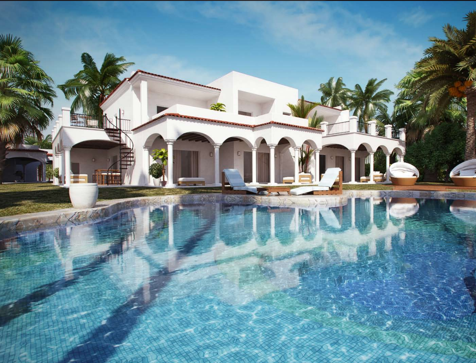
scene 02 post production

Have you ever wanted to make professional exterior renderings? Do you know how to use V-RaySun, V-RaySky and V-RayPhysicalCamera? Have you ever had problems with composition? Archexteriors will end all your problems. Take a look at this 10 fully textured scenes with professional shaders and lighting ready to render. Get your own portfolio and join cg market.