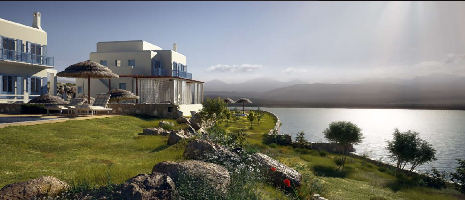
scene 01 post production

Have you ever wanted to make professional exterior renderings? Do you know how to use V-RaySun, V-RaySky and V-RayPhysicalCamera? Have you ever had problems with composition? Archexteriors will end all your problems. Take a look at this 10 fully textured scenes with professional shaders and lighting ready to render. Get your own portfolio and join cg market.