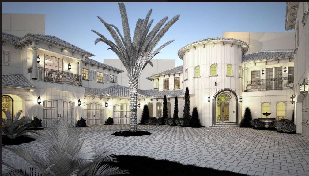
scene 07 wire

Software and models © 2015 EVERMOTION. EVERMOTION logo is trademark or registered trademark of Evermotion Inc. in the U.S. and/or other countries. All rights reserved. All *.max and bitmaps models included on this collection with data are an integral part of „archexteriors vol.25” and the resale of this data is strictly prohibited. All models can be used for commercial purposes only by owners who bought this collection. The sharing of collection is strictly prohibited unless that user has written authorization from EVERMOTION.