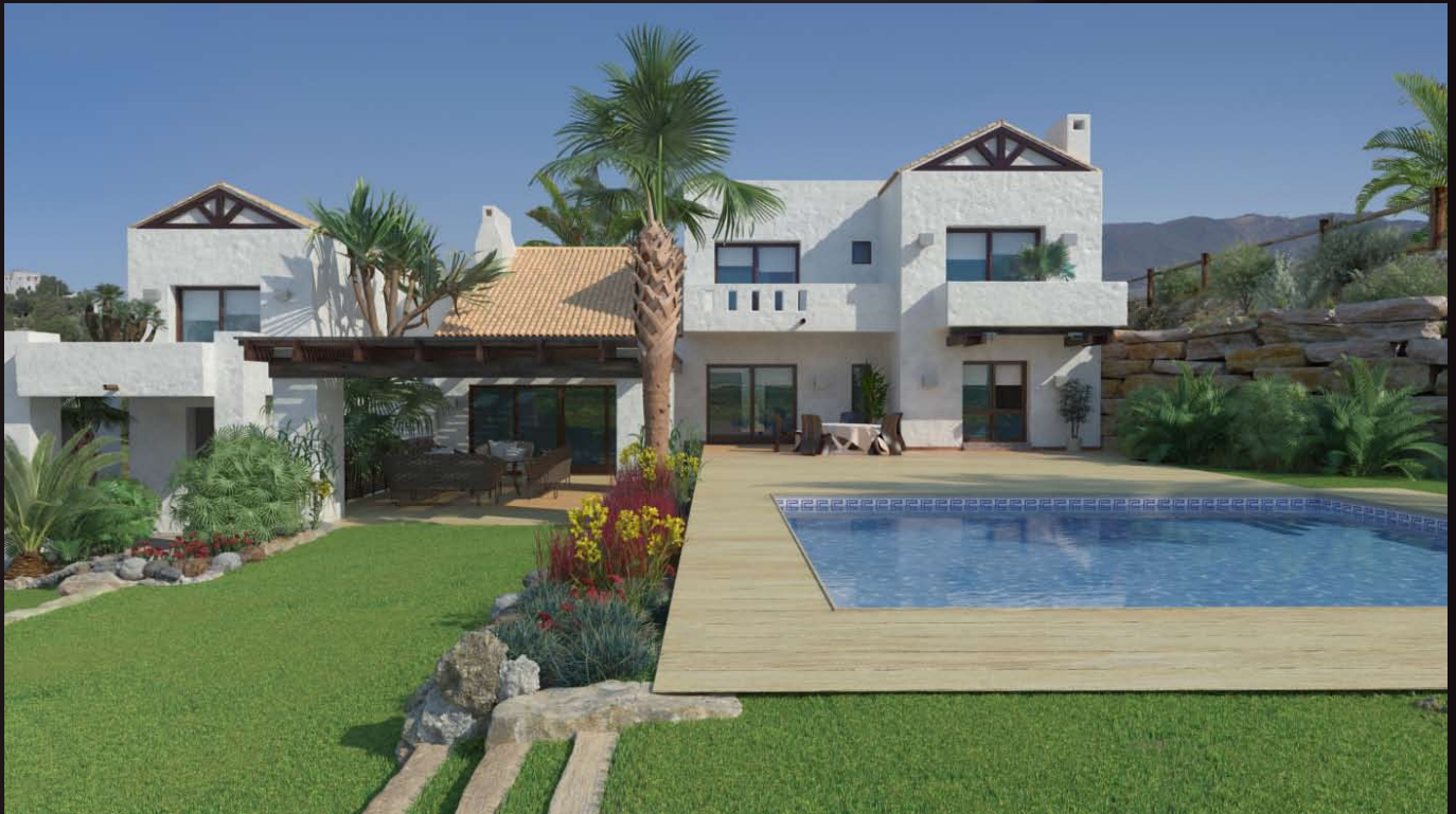
scene 08 raw

Have you ever wanted to make professional exterior renderings? Do you know how to use V-RaySun, V-RaySky and V-RayPhysicalCamera? Have you ever had problems with composition? Archexteriors will end all your problems. Take a look at this 10 fully textured scenes with professional shaders and lighting ready to render. Get your own portfolio and join cg market.