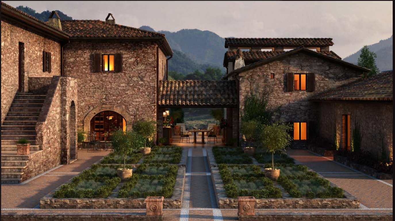
scene 06 raw

Have you ever wanted to make professional exterior renderings? Do you know how to use V-RaySun, V-RaySky and V-RayPhysicalCamera? Have you ever had problems with composition? Archexteriors will end all your problems. Take a look at this 10 fully textured scenes with professional shaders and lighting ready to render. Get your own portfolio and join cg market.