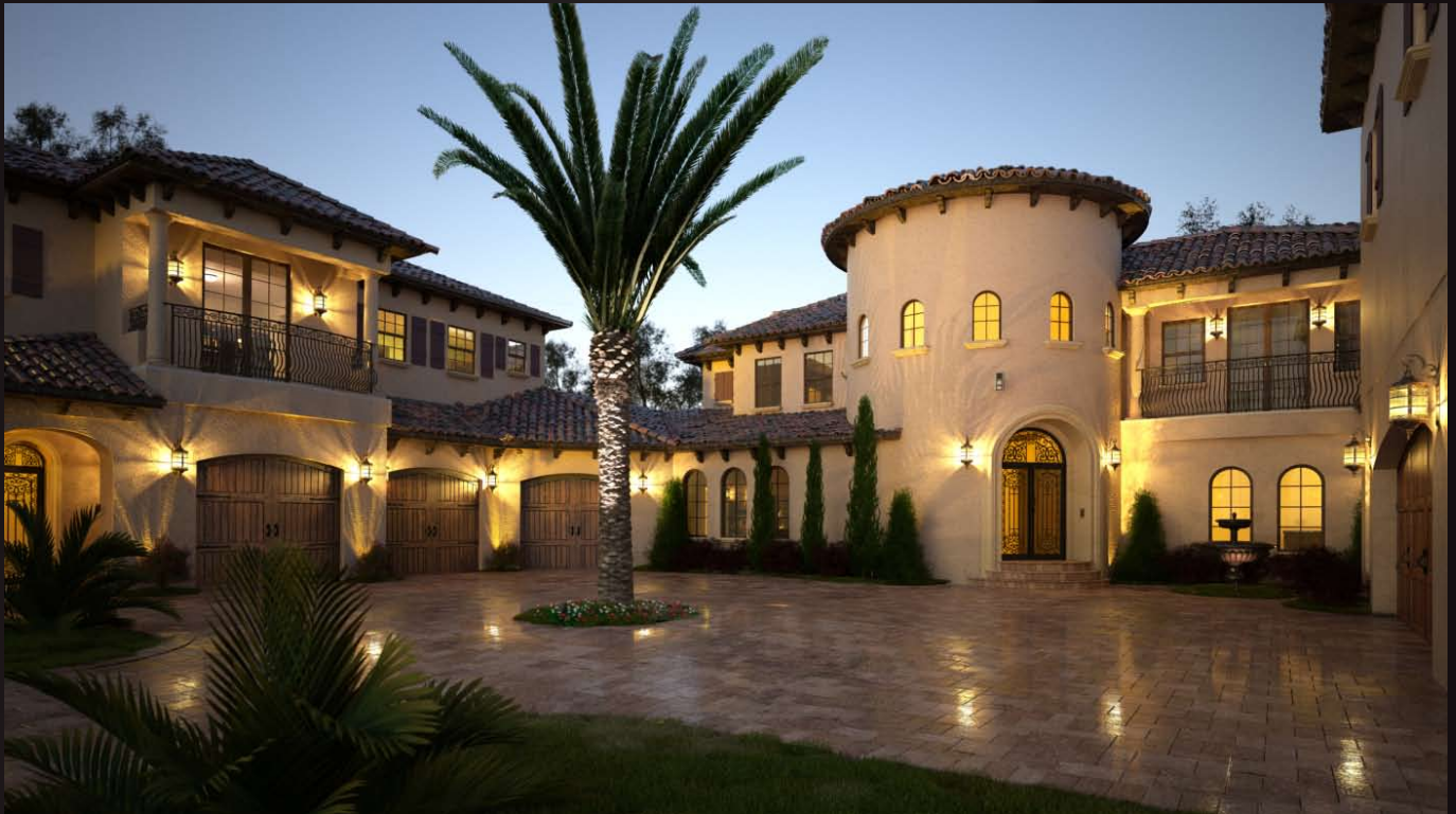
scene 07 raw

Have you ever wanted to make professional exterior renderings? Do you know how to use V-RaySun, V-RaySky and V-RayPhysicalCamera? Have you ever had problems with composition? Archexteriors will end all your problems. Take a look at this 10 fully textured scenes with professional shaders and lighting ready to render. Get your own portfolio and join cg market.