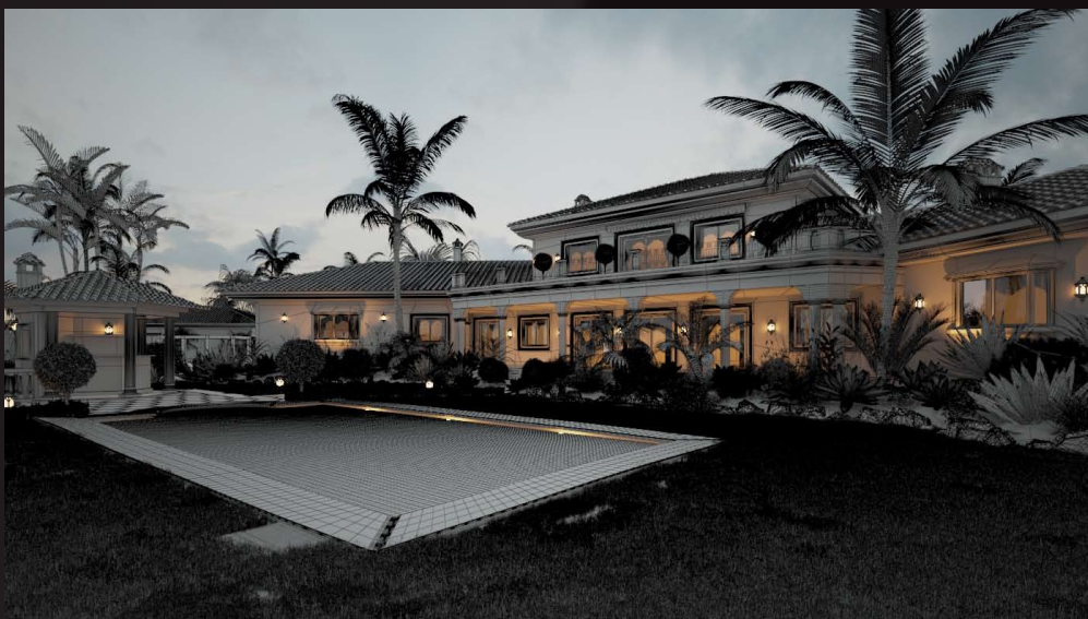
scene 03 wire

Software and models © 2015 EVERMOTION. EVERMOTION logo is trademark or registered trademark of Evermotion Inc. in the U.S. and/or other countries. All rights reserved. All *.max and bitmaps models included on this collection with data are an integral part of „archexteriors vol.25” and the resale of this data is strictly prohibited. All models can be used for commercial purposes only by owners who bought this collection. The sharing of collection is strictly prohibited unless that user has written authorization from EVERMOTION.