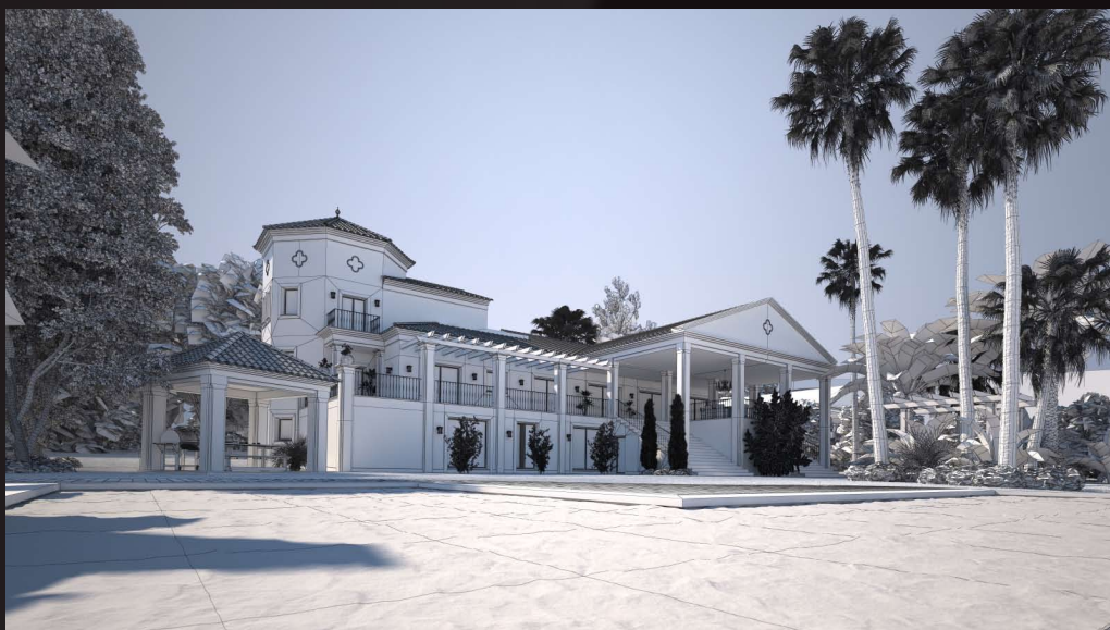
scene 10 wire

Software and models © 2015 EVERMOTION. EVERMOTION logo is trademark or registered trademark of Evermotion Inc. in the U.S. and/or other countries. All rights reserved. All *.max and bitmaps models included on this collection with data are an integral part of „archexteriors vol.25” and the resale of this data is strictly prohibited. All models can be used for commercial purposes only by owners who bought this collection. The sharing of collection is strictly prohibited unless that user has written authorization from EVERMOTION.