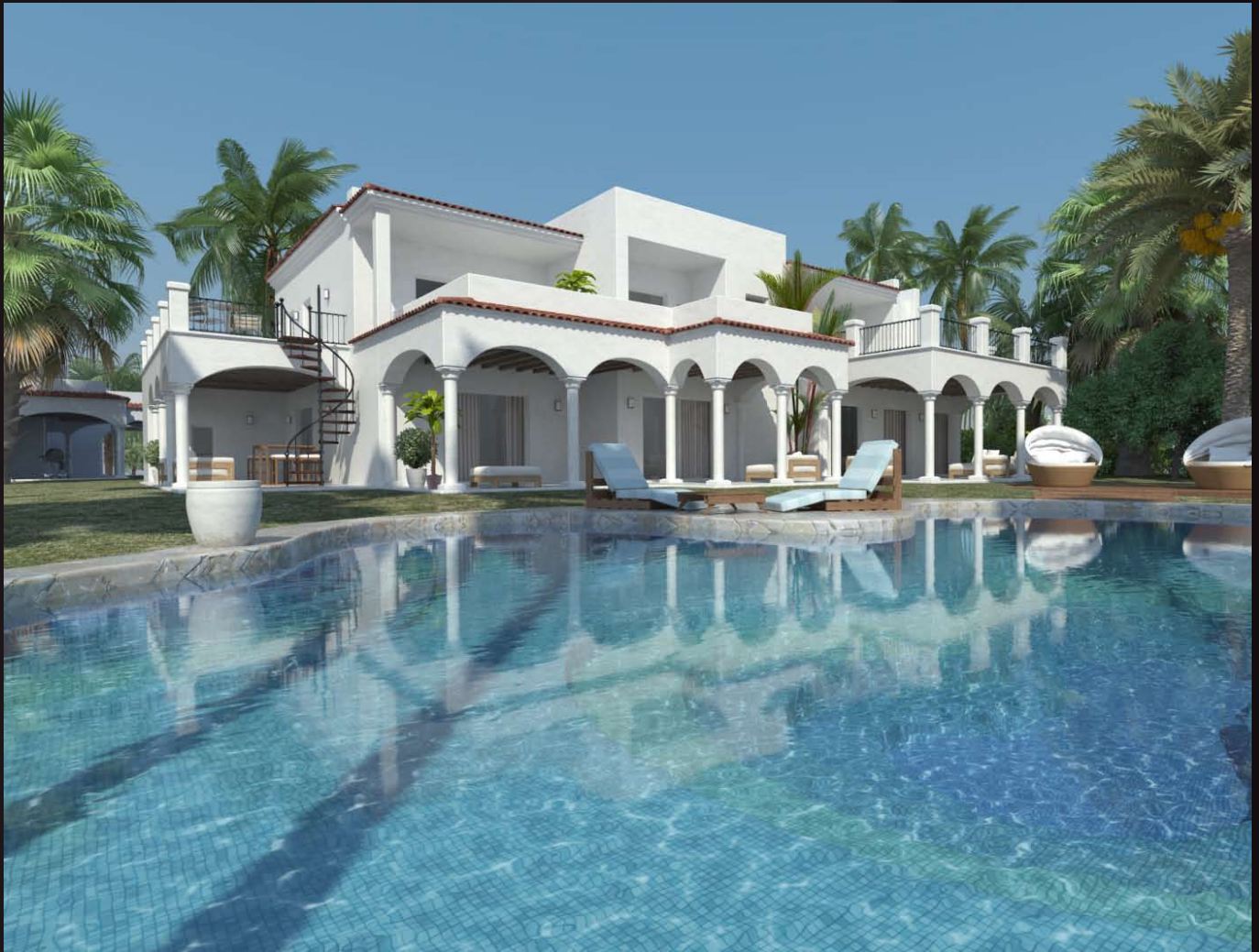
scene 02 raw

Have you ever wanted to make professional exterior renderings? Do you know how to use V-RaySun, V-RaySky and V-RayPhysicalCamera? Have you ever had problems with composition? Archexteriors will end all your problems. Take a look at this 10 fully textured scenes with professional shaders and lighting ready to render. Get your own portfolio and join cg market.