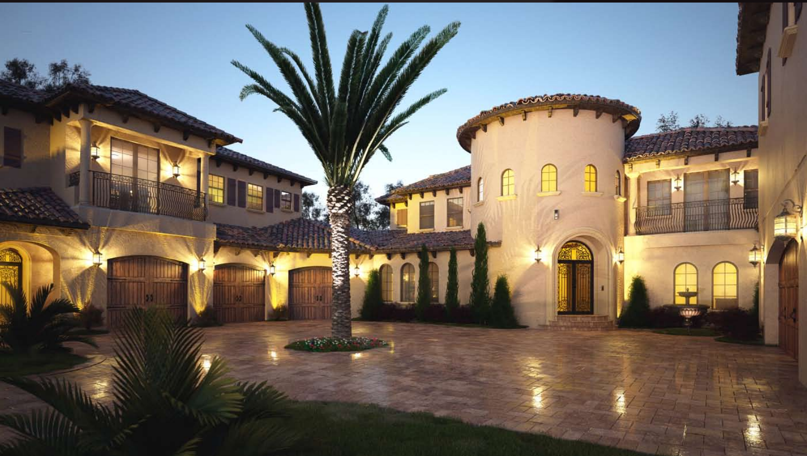
scene 07 post production

Have you ever wanted to make professional exterior renderings? Do you know how to use V-RaySun, V-RaySky and V-RayPhysicalCamera? Have you ever had problems with composition? Archexteriors will end all your problems. Take a look at this 10 fully textured scenes with professional shaders and lighting ready to render. Get your own portfolio and join cg market.