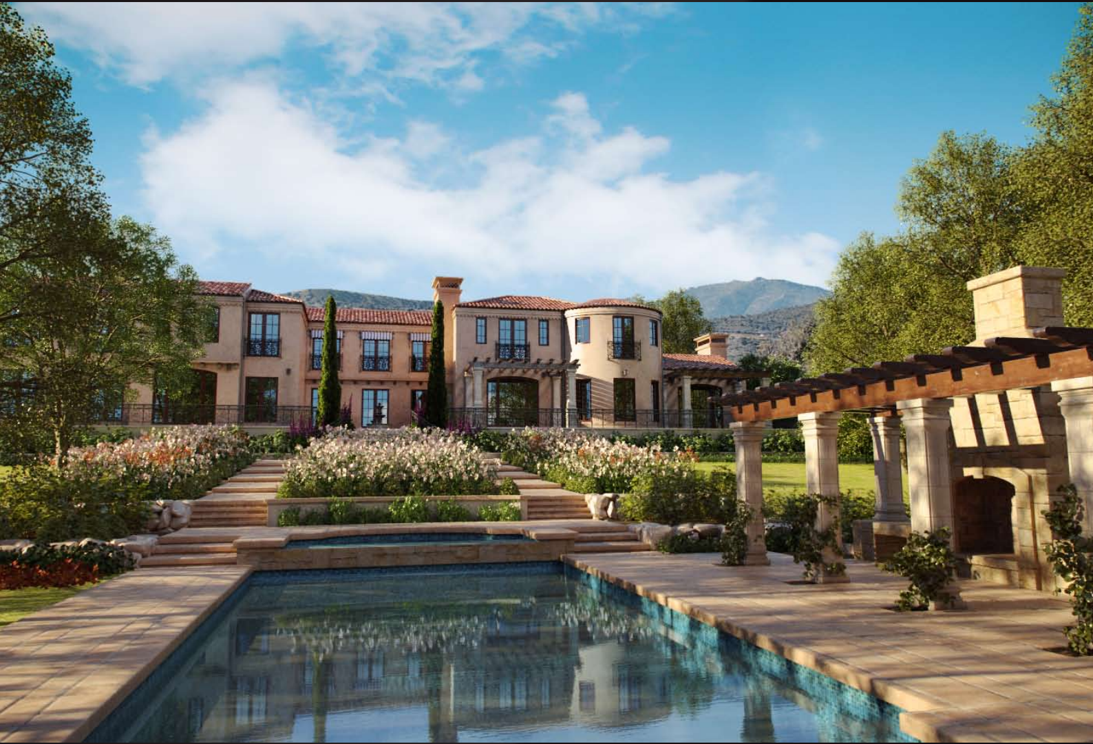
scene 04 post production

Have you ever wanted to make professional exterior renderings? Do you know how to use V-RaySun, V-RaySky and V-RayPhysicalCamera? Have you ever had problems with composition? Archexteriors will end all your problems. Take a look at this 10 fully textured scenes with professional shaders and lighting ready to render. Get your own portfolio and join cg market.