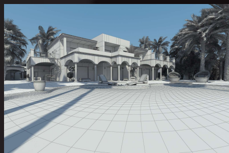
scene 02 wire

Software and models © 2015 EVERMOTION. EVERMOTION logo is trademark or registered trademark of Evermotion Inc. in the U.S. and/or other countries. All rights reserved. All *.max and bitmaps models included on this collection with data are an integral part of „archexteriors vol.25” and the resale of this data is strictly prohibited. All models can be used for commercial purposes only by owners who bought this collection. The sharing of collection is strictly prohibited unless that user has written authorization from EVERMOTION.