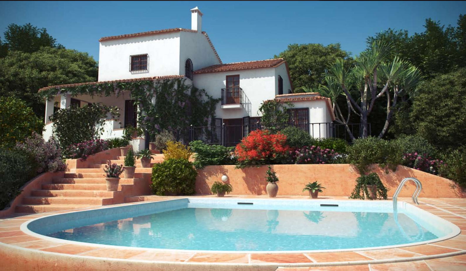
scene 09 post production

Have you ever wanted to make professional exterior renderings? Do you know how to use V-RaySun, V-RaySky and V-RayPhysicalCamera? Have you ever had problems with composition? Archexteriors will end all your problems. Take a look at this 10 fully textured scenes with professional shaders and lighting ready to render. Get your own portfolio and join cg market.