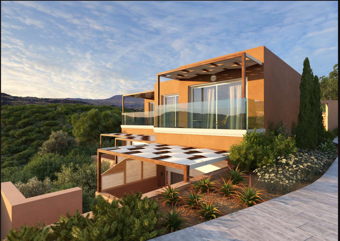
scene 05 raw

Have you ever wanted to make professional exterior renderings? Do you know how to use V-RaySun, V-RaySky and V-RayPhysicalCamera? Have you ever had problems with composition? Archexteriors will end all your problems. Take a look at this 10 fully textured scenes with professional shaders and lighting ready to render. Get your own portfolio and join cg market.