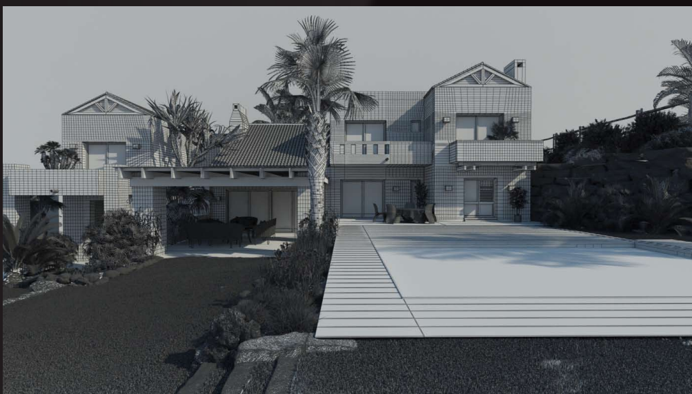
scene 08 wire

Software and models © 2015 EVERMOTION. EVERMOTION logo is trademark or registered trademark of Evermotion Inc. in the U.S. and/or other countries. All rights reserved. All *.max and bitmaps models included on this collection with data are an integral part of „archexteriors vol.25” and the resale of this data is strictly prohibited. All models can be used for commercial purposes only by owners who bought this collection. The sharing of collection is strictly prohibited unless that user has written authorization from EVERMOTION.