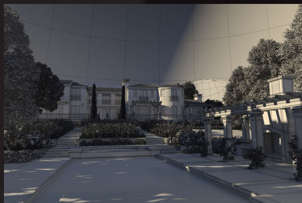
scene 04 wire

Software and models © 2015 EVERMOTION. EVERMOTION logo is trademark or registered trademark of Evermotion Inc. in the U.S. and/or other countries. All rights reserved. All *.max and bitmaps models included on this collection with data are an integral part of „archexteriors vol.25” and the resale of this data is strictly prohibited. All models can be used for commercial purposes only by owners who bought this collection. The sharing of collection is strictly prohibited unless that user has written authorization from EVERMOTION.