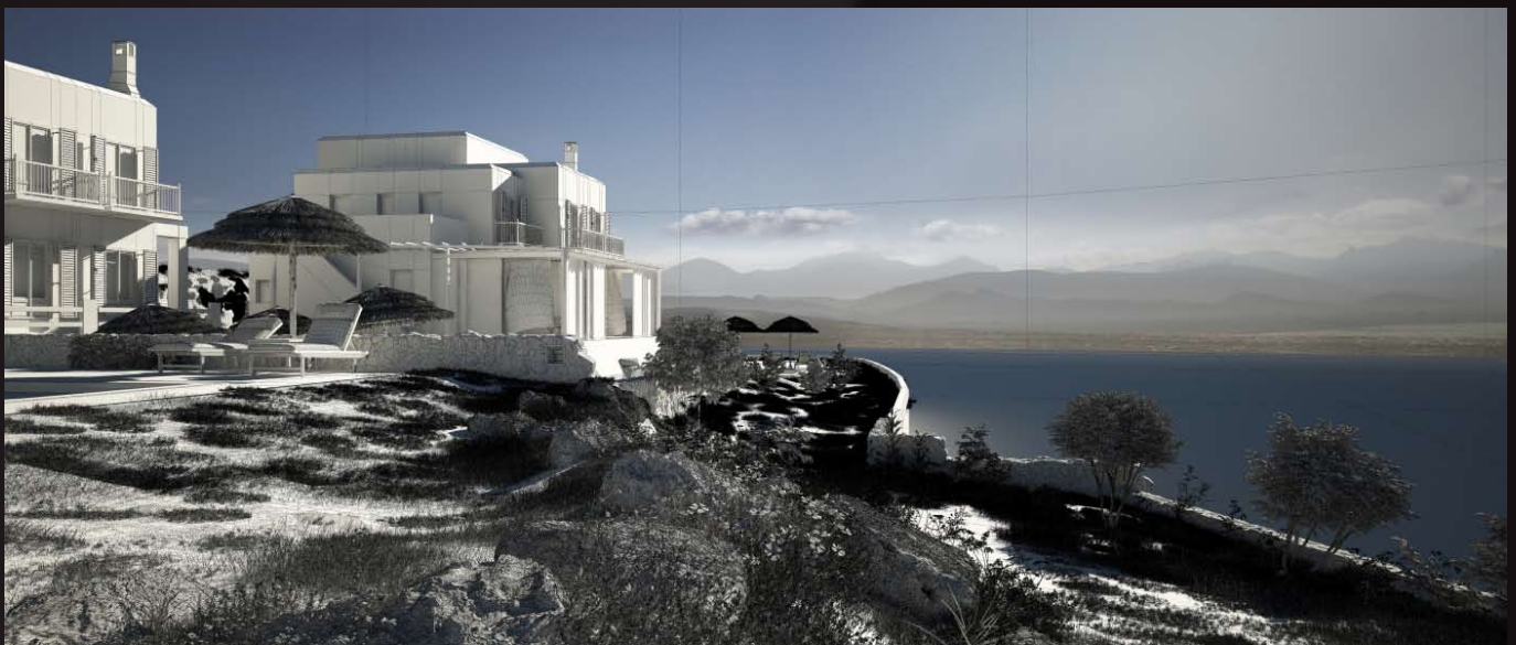
scene 01 wire

Software and models © 2015 EVERMOTION. EVERMOTION logo is trademark or registered trademark of Evermotion Inc. in the U.S. and/or other countries. All rights reserved. All *.max and bitmaps models included on this collection with data are an integral part of „archexteriors vol.25” and the resale of this data is strictly prohibited. All models can be used for commercial purposes only by owners who bought this collection. The sharing of collection is strictly prohibited unless that user has written authorization from EVERMOTION.