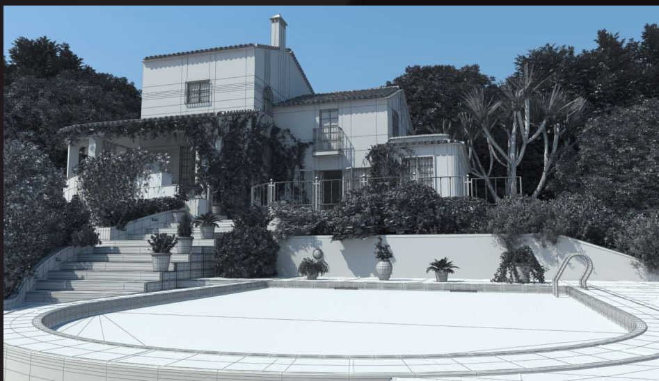
scene 09 wire

Software and models © 2015 EVERMOTION. EVERMOTION logo is trademark or registered trademark of Evermotion Inc. in the U.S. and/or other countries. All rights reserved. All *.max and bitmaps models included on this collection with data are an integral part of „archexteriors vol.25” and the resale of this data is strictly prohibited. All models can be used for commercial purposes only by owners who bought this collection. The sharing of collection is strictly prohibited unless that user has written authorization from EVERMOTION.